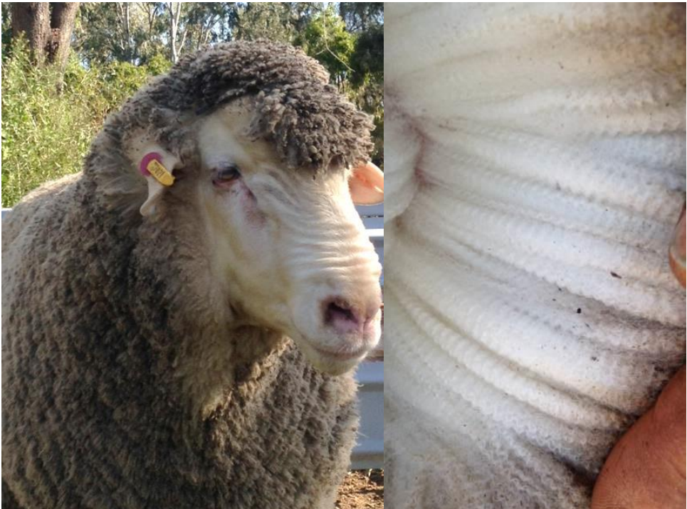
Empire 13-7021 'Tom'

MD13-7021 semen sales include Stirling Stud (VIC), Mt Alma Stud (SA), Kardinia Stud (NSW), Far Valley Stud (WA), Kintail Park Stud (WA), Chirniminup Stud (WA) and also North America, Chile, Argentina and Uruguay. Elite sire MD15-1827 has progeny in this year's sale.