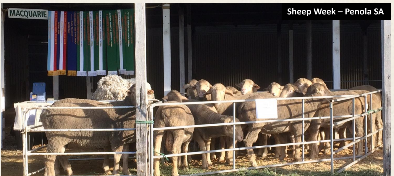
Sheep Week – Penola SA