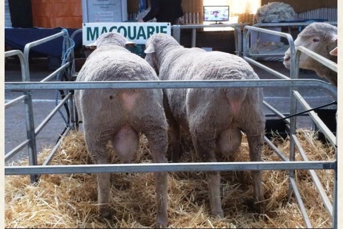
Campbell Town Show Campbell Town TAS