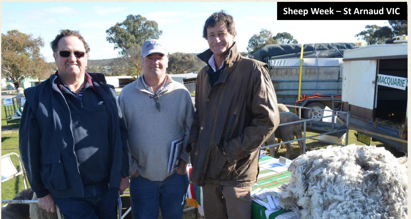
Sheep Week – St Arnaud VIC