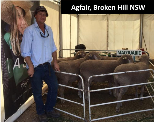
Agfair, Broken Hill NSW