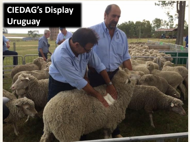
CIEDAG's Display Uruguay

Macquarie Blood 2 Tooth Ram – La Pastoral Stud.