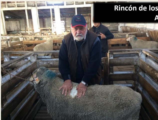
Rincón de los Morros Stud Display Argentina

Macquarie Blood 2 Tooth Ram – La Pastoral Stud.