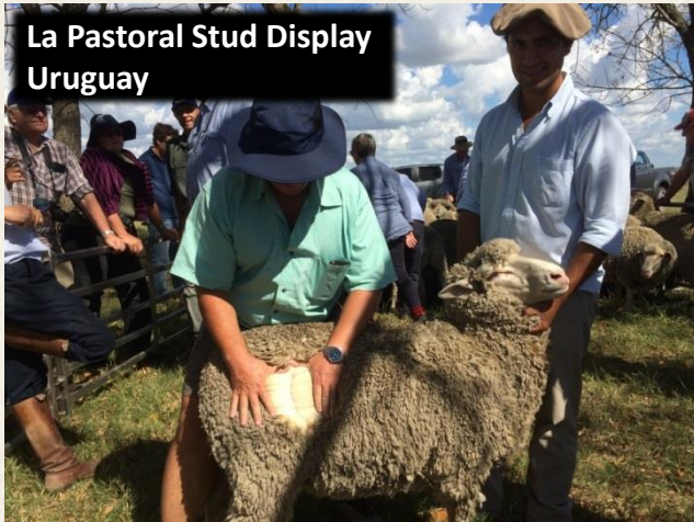
La Pastoral Stud Display Uruguay

In April Greg and John attended the Global Dohne Conference and tour of Uruguay, Argentina, and Chile. From the hot, humid temperate Uruguay of 1200-1500 mm annual rainfall to the bitterly cold and dry southern Patagonia with an average summer temperature of 6.7 degrees Celsius and average winter temperature of 3.1 degrees Celsius along with an average rainfall of 200 mm and low protein native pastures, the Dohnes performed extremely well. Macquarie blood was well represented. Of the 12 studs and research stations visited, 7 are Macquarie based. Progeny of 'Tom' were on display and excelled in every area.